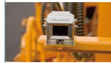
▲ Monitoring Systems for Rear, Right & Left side view