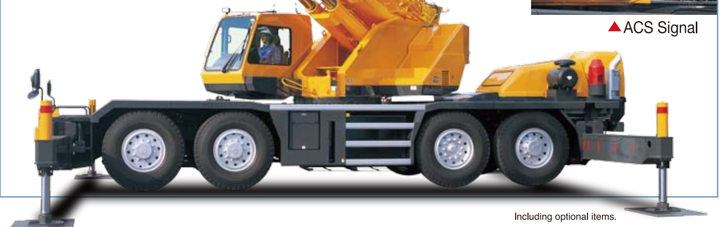
Including optional items.