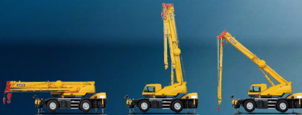
● Joint the Tension Rod