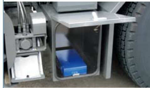
▲ Tool Box