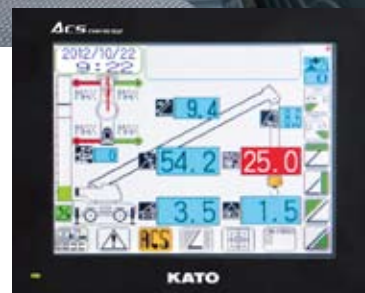
▲ ACS Moment limiter