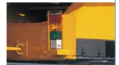
▲ ACS Signal