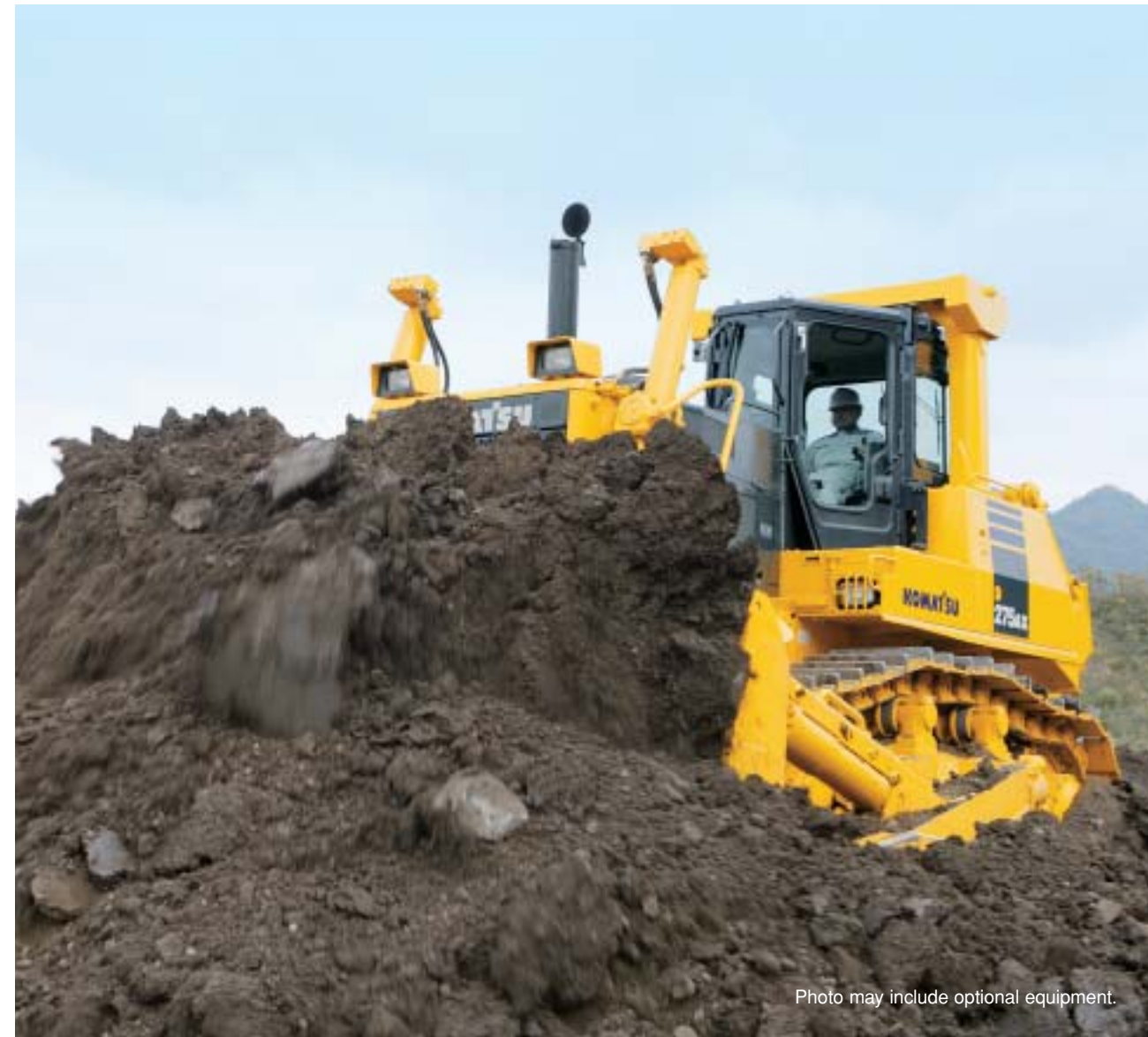
Photo may include optional equipment.