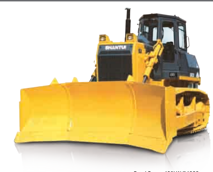
SD22C A Use: Coal

Rated Power: 162kW@1800rpm Engine Model: Cummins NT855-C280S10 Operating Weight: 24.6 tons