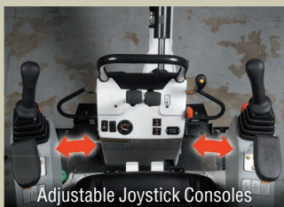
Adjustable Joystick Consoles