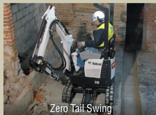
Zero Tail Swing