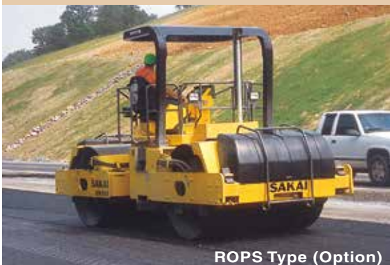
ROPS Type (Option)