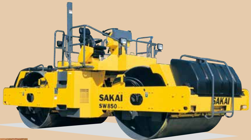
SW850 12.5ton/2.0m (27,560lb/79")