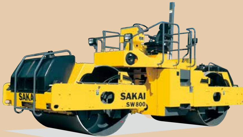
SW800 10.4ton/1.7m (22,930lb/67")

Double Drum Vibratory Roller, articulated, fully hydrostatic drive, including high frequency vibration for Superpave mix