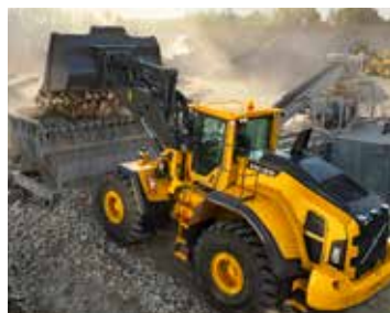
Volvo Construction Equipment