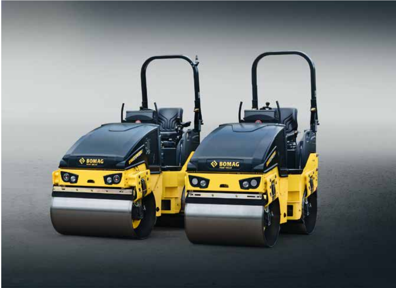
BW 100/120: The multi-talents from 2.3 to 3.7 t.

BOMAG offers the right machine for every application. Select the roller and equipment that is perfectly suited to you, your requirements and your company from 14 different models.