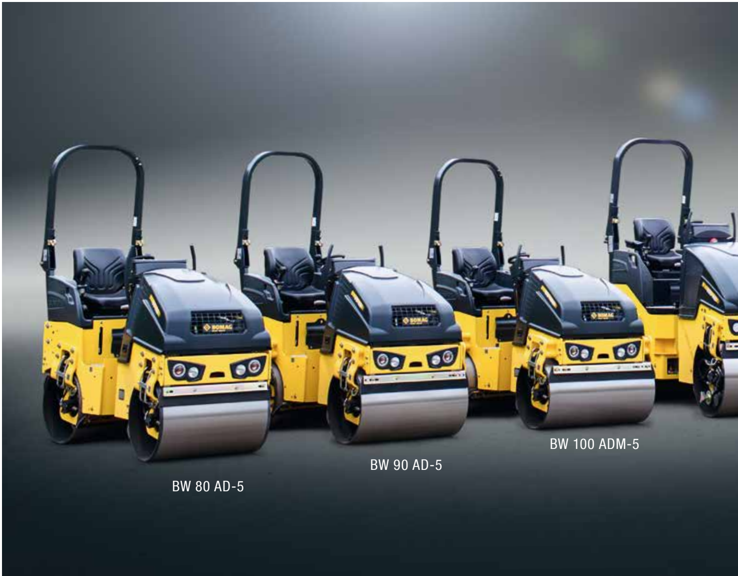
BW 80 AD-5