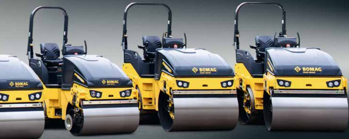
BW 120 AD-5