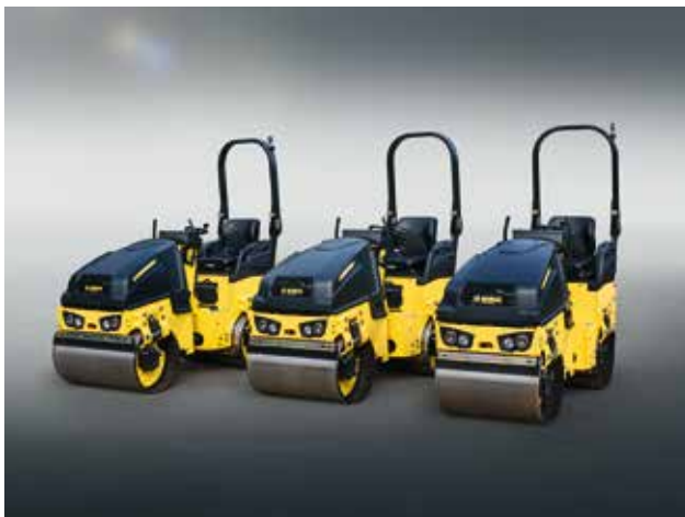
BW 80/90/100: The light line up to 1.8 t.