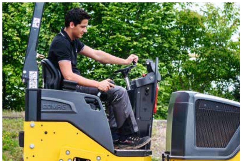
Ample leg room for the operator ensures a comfortable working environment.

The response of the control lever is very pleasant; reversing is modulated and very precise. Drum vibration can be activated selectively for the front or rear only, or for both drums. In tandem with the IVC (Intelligent Vibration Control) system, the exciter system guarantees consistent compaction and reliable operation at all times.