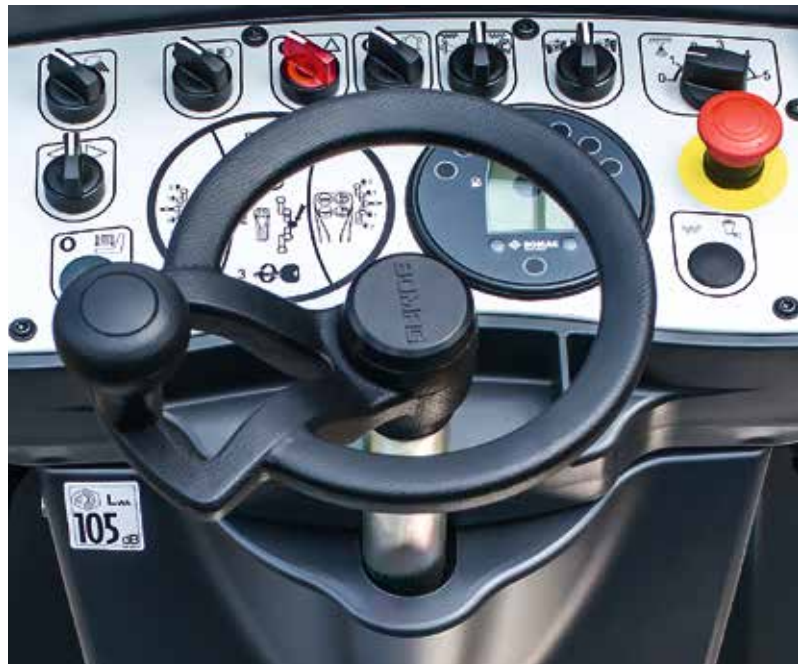
Large switches, a compact steering wheel and clearly arranged controls make it easy for any operator to work with a light BOMAG tandem roller.

Every function is self-explanatory and intuitive to operate after a very short time. As with every BOMAG tandem roller, the main functions can be selected precisely and error-free by the ergonomic control lever.