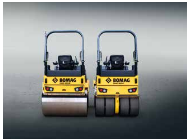
BW 135/138: The heavyweights from 3.9 to 4.3 t.