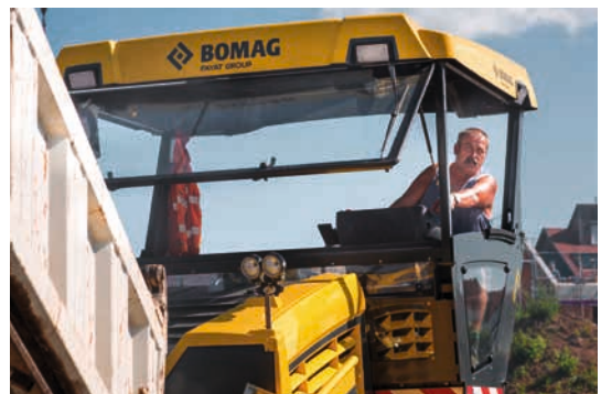
The right position in each situation – the comfortable driver's cabin.