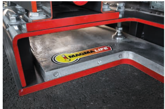
Heats up nearly 60 % quicker – unique MAGMALIFE heating system.