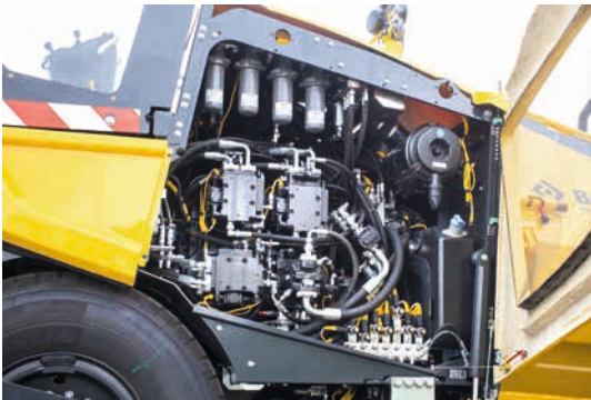
Save up to 17 % fuel – demand-driven hydraulics – with BOMAG ECOMODE.