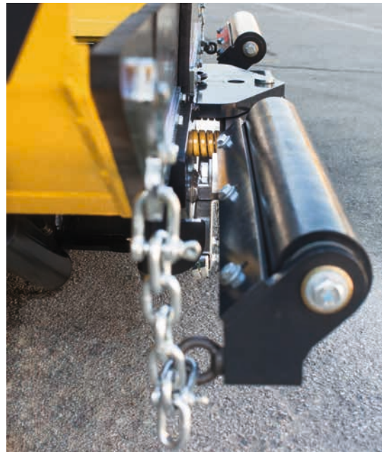
Impact-free docking – dampened bumper.