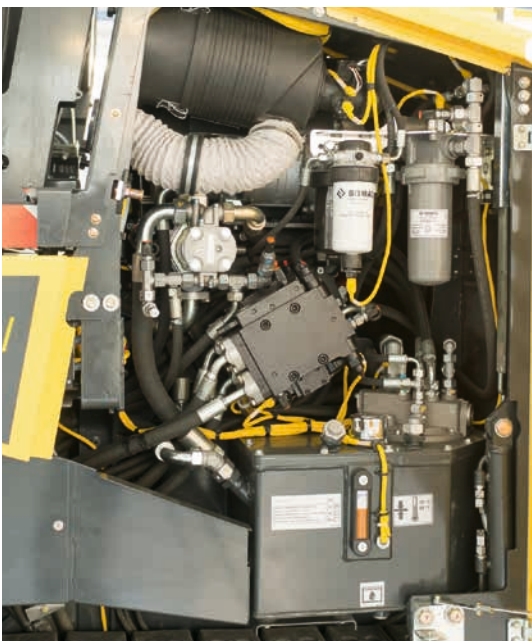
Save up to 17 % fuel – demand-driven hydraulics – with BOMAG ECOMODE.