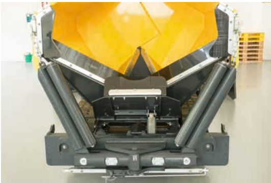
Hydraulic front gate – for a clean material flow.